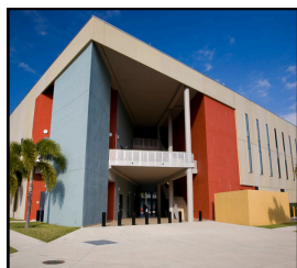
University & Research Lab Moves

GenVault Transport Services specializes in the safe, efficient, and at-temperature relocation of laboratory equipment and critical biological materials. From ultra-low freezers and cryogenic storage to temperature-sensitive biospecimens, we handle every move with precision and care — so you can focus on your research while we take care of the logistics.