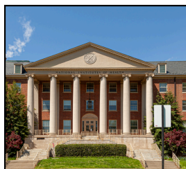
Government Research Lab Moves